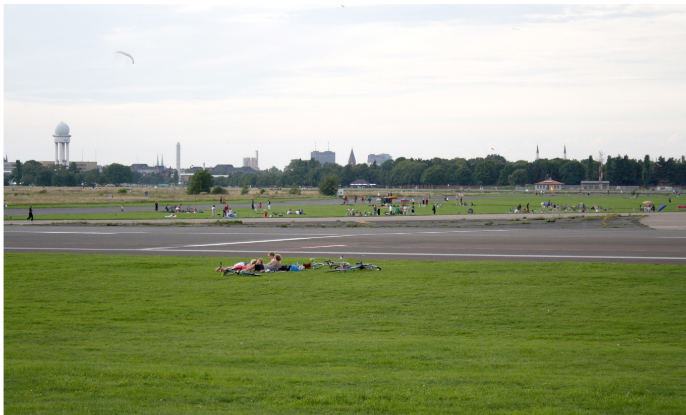
Tempelhof Park in summer 2010