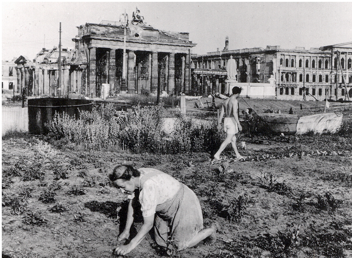
Vegetable garden near the Brandenburg Gate, 1947. Postcard