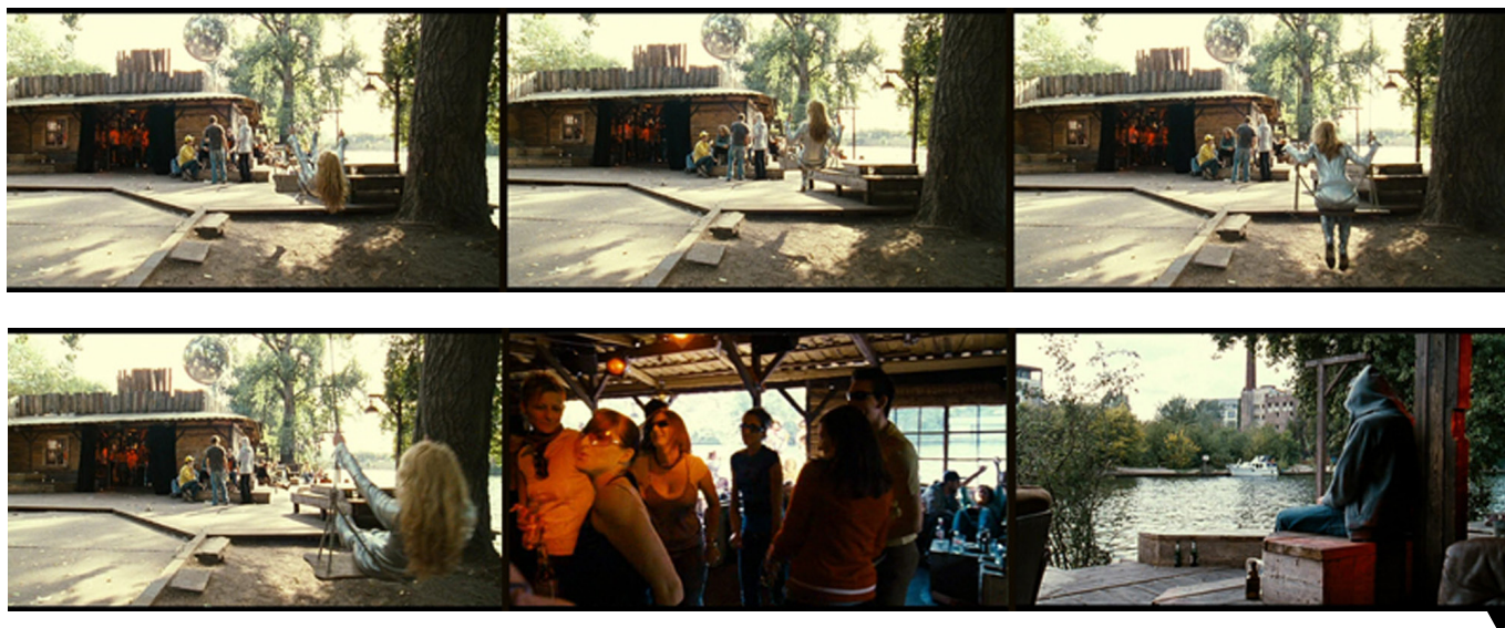
'Berlin calling' (2008) film scenes picturing Bar25

'Mediaspree versenken' claimed that the development strategy would only provide cultural services for a very limited group of people. Simultaneously, according to the activists, new development would push aside current people producing cultural values. People who demonstrated against the development plan also organised a party on the streets, bringing the values they were protecting into public space with loud music and dance. For a short time the streets were converted into temporary event venues.