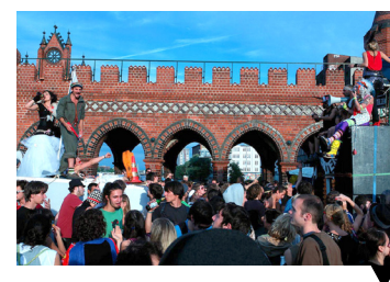
'Mediaspree versenken' party-demo, 2008.

Another example of political will is the case of the former Tempelhof airport . Tempelhof airport was situated between the districts of Neukölln and Tempelhof, quite in the heart of Berlin. The airport was closed in 2008 due to the plans to create one joint airport outside the city borders. In the summer of 2009 few thousands of activists planned to squat the area protesting against the privatisation and capitalisation of the urbanspace, but the action was stopped by the police. In May 2010 the area of the airport was opened for the public just as it was and named the Tempelhof Park . The new park, using the inherent airport infrastructure of about 300 hecta acres had possibilities for various activities: cycling, skating, kiting, picnics, grilling, sunbathing, watching birds and insects, inventing and trying new sports, enjoying the sunset and sunrise. Tempelhof Park was planned, though, as temporary: the future development strategy included converting the area into a part of the IGA 2017 (International Garden Exhibition) 3 area to be followed by and following a conversion into the area of mixed recreation and living functions. In 2011 the activist group ' 100% Tempelhofer Feld ' 4 was created, fighting against the