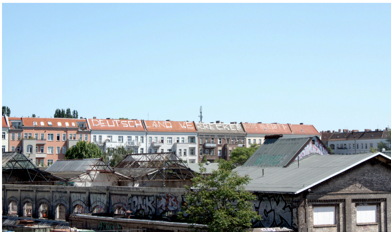
The protest of Köpi in big and red.