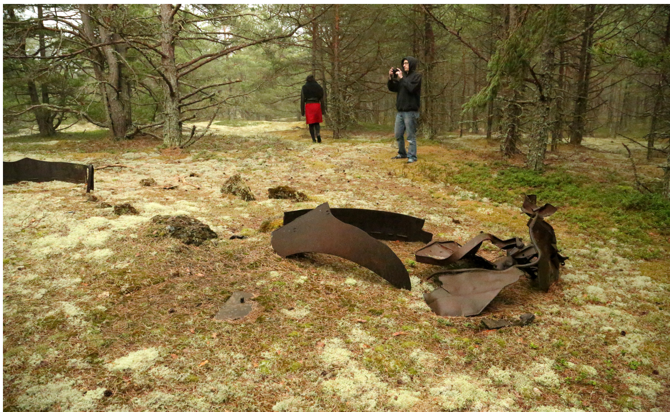
Naissaar. Expedition among nature-and-military debris.