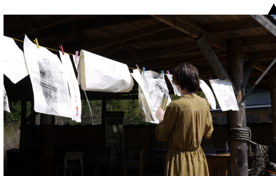
Naissaar. Omari küün. Grafodroom presentation.

We hoped and planned the island to be a good site for peer-relations, supporting diversity among the layers of difference between different histories, people and places. Our Camp Pixelache approach embraces an “open planning” unconference-style, where participants to finally ultimately decide on the first day themselves what to put in the schedule, including suggestions for presentations and discussions (workshops were decided in advance). Ville Hyvönen from Pixelache organised the logistics and arranged that we could use the Kaljuste's Omari Küün complex and Naissaare Külalistemaja hostel as main camp bases. The Camp Pixelache participants were a mix of cultural and educational professionals, activists, students, and other inbetween roles, from a variety of countries and continents – from as far away as Taiwan and Indonesia to Estonia, Austria and the Netherlands, UK and USA, Colombia and Brazil. We placed advance nominations of activities and talks onto a large fabric “spreadsheet” that was attached to the side of the building: with spaces/venues along the top, and time schedule down the left-side. Dubbed by one as a the “felt excel”, it served as a flexible and moveable event schedule, with “post-it” squares of felt and paper, which allowed participants to write up their ideas for events. Over two days, it was the common reference point for what people wished to do and what to take part in.