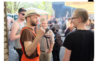
Tallinn. EKKM. Closing party.