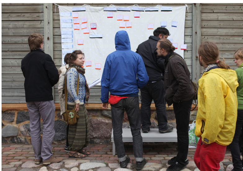
Naissaar. Omari küün. Organising scheduling using felt-excel.